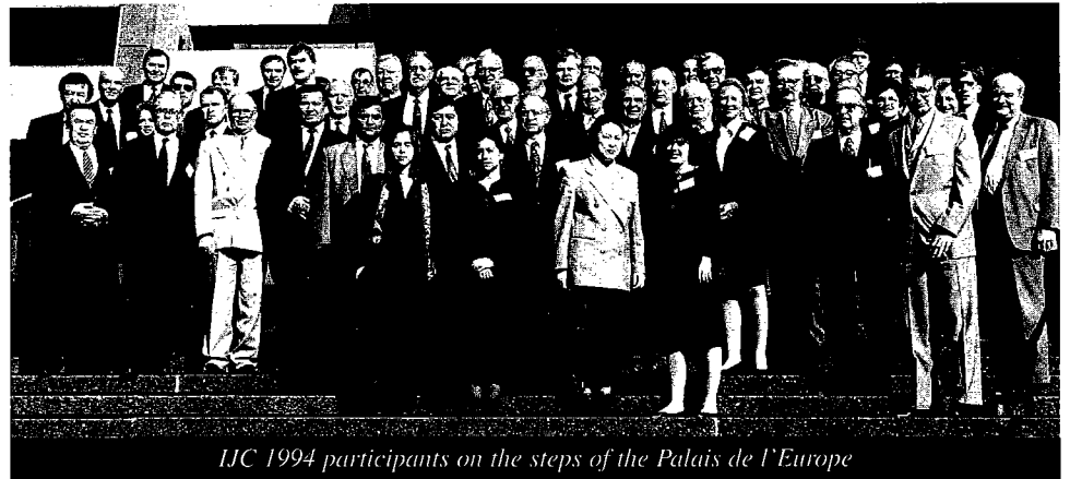
IJC 1994 participants on the steps of the Palais de l'Europe

Each year, the conference addresses different issues related to the general theme of judicial independence, although specific agenda items have changed to reflect the increasing experience and understanding of newer participants from regions outside of Western Europe. In its earliest years, the conference handled issues such as judicial training and the implementation and enforcement of